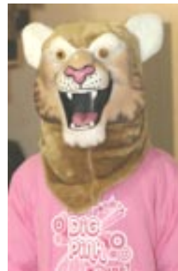
Even the Thomas Stone Cougar was digging pink!