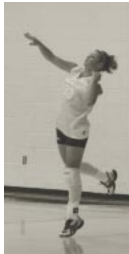
Dig Pink was a success all around, as Stone defeated North Point in 5 games

The event turned the Stone gymnasium into a