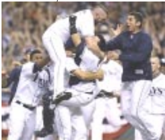
The Rays celebrate their first trip to the World Series

Before this season the Red Sox would have looked at the "Devil Rays" as a joke, but this season they had to be taken seri-